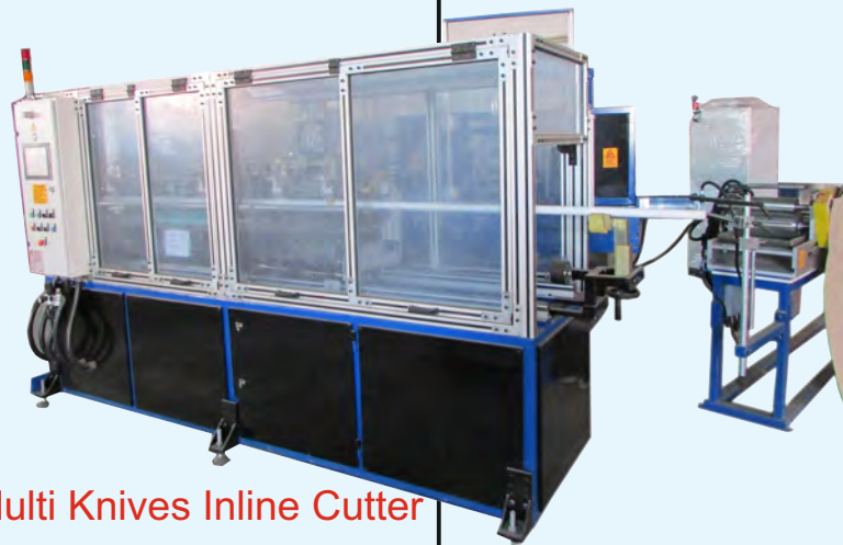
Multi Knives Inline Cutter